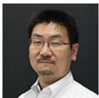
Chair Miyahara Basara, Japan