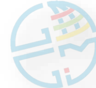
EB Member TBA, Republic of Korea