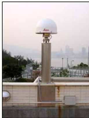
FOMO, Macau, China