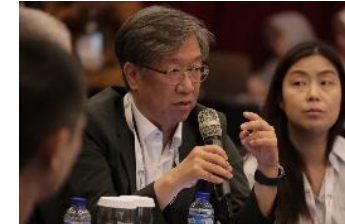
Rep. of Korea